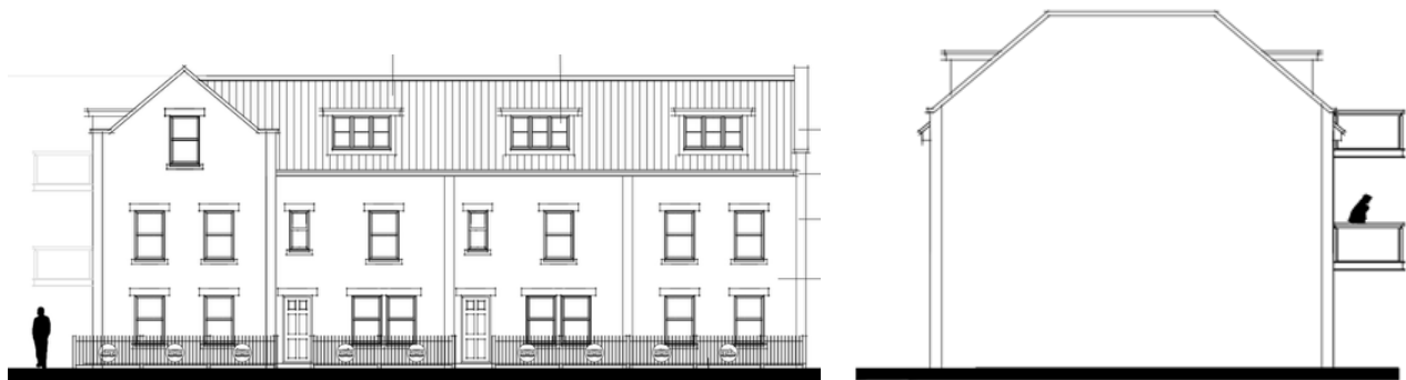
(Block A Plans and Elevations 21.038-020 - P21/07653/RM)

Regarding the doors on this elevation, it has been confirmed that they are 'False' doors for aesthetic purpose and, having reviewed the 'Block A Plans and Elevations 21.038-020' It does not appear that there is any requirement to create a step into the street. Essentially the plans demonstrate that the elevation will be flush with its connection to the pavement when view sideways on. I have attached these elevation drawings below for further reference.